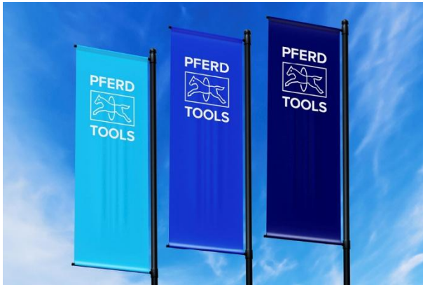
Fresh colors, modernized logo, clear positioning in the name - the new brand identity of PFERD TOOLS