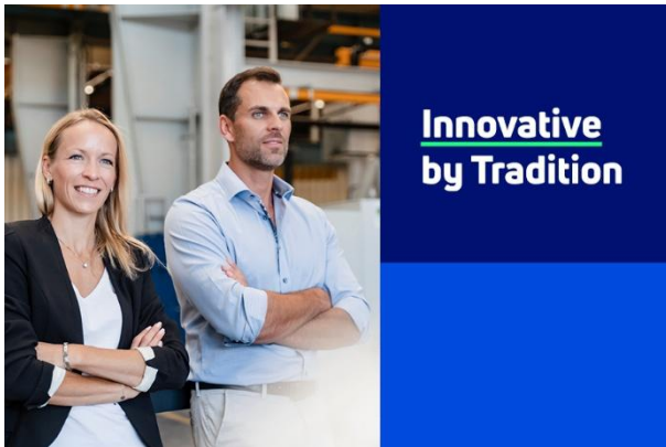
Focusing on people and innovative by tradition - the new PFERD TOOLS claim