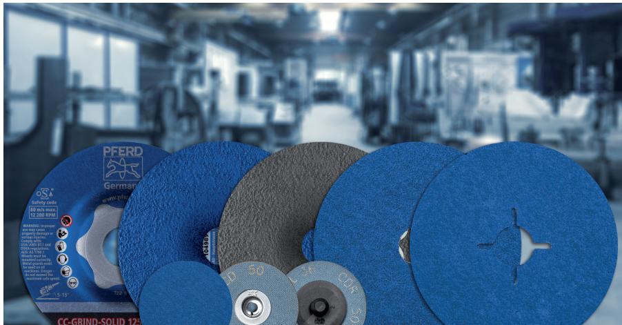
Image 1 More powerful than any other abrasive – VICTOGRAIN from PFERD

Number of characters 3,607 (including spaces)