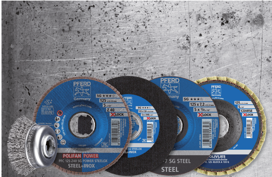
Image 1 PFERD offers an extensive range of tools with X-LOCK quick-change system.

Number of characters 1,679 (inclusive spaces)